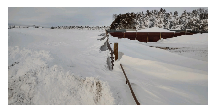
Fig. 5 Nebraska Snow Storm