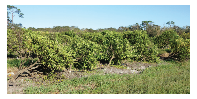
Fig.6 Wind Damage to Florida Citrus Trees

Consider what happens if sheltering operations need to move to a new site during a disaster, and the COAD does not have an MOU for the facility. COADs need to be flexible and ready to reach out to the network of COAD members and partners in emergency management, local government, and state and national partners.