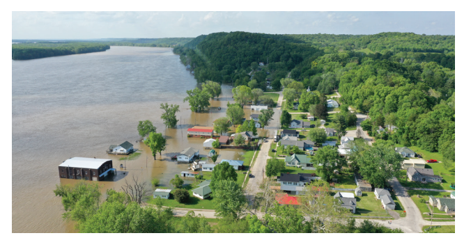
Fig. 7 Mississippi River Flood in Illinois