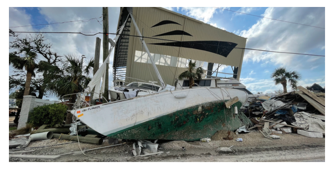
Fig.3 Ft. Meyers, FL Hurricane

Collaborate with Community Emergency Response Team (CERT) and Medical Reserve Corps (MRC)