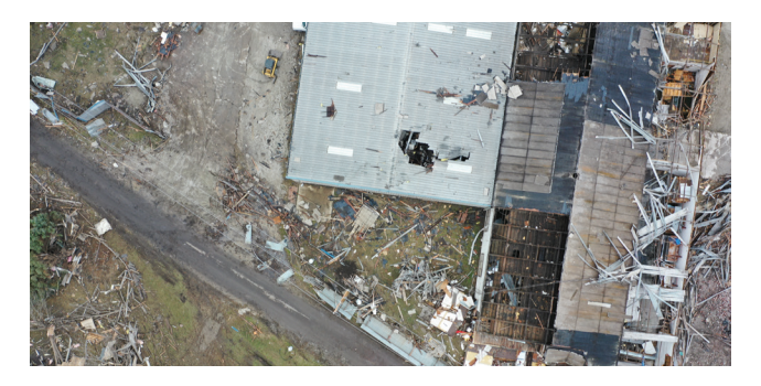
Fig. 4 Taylorville, IL Tornado